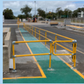
BOYNE SMELTERS LMTD - Pedestrian segregation & line marking