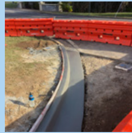
GLADSTONE REGIONAL COUNCIL - Curb and channelling