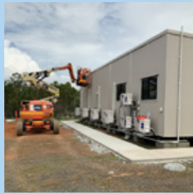
ORICA - Turnaround office installation